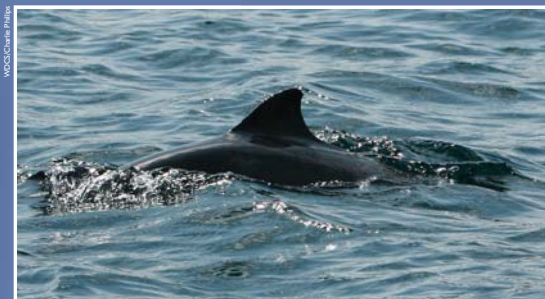
If you are really lucky, you might spot a harbour porpoise.