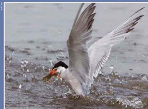
Look out for terns fishing. They dive bomb down, disappear briefly underwater, then rise up again – fish in beak.