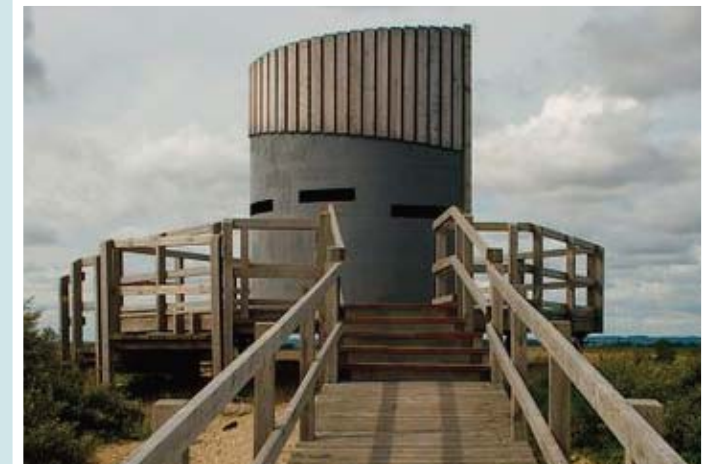
Lincolnshire County Council

The Round and Round House is one of our 'Bathing Beauties' – Beach Huts for the 21st century. Its all-round views also make it ideal for bird watching.