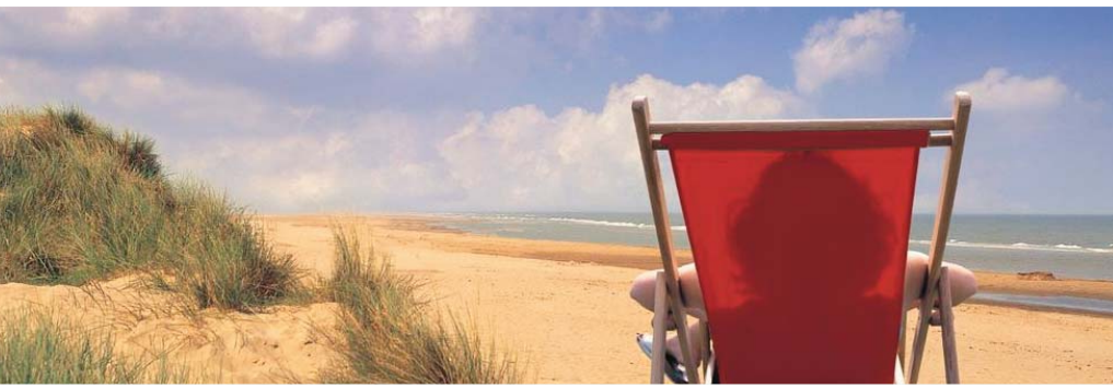
Lincolnshire County Council